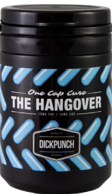
THE HANGOVER 15mg THC/15mg CBD Contains: MCT oil, CBD isolate, THC Distillate.