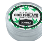
1g | 1000mg