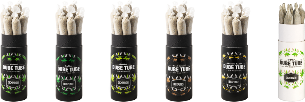
HYBRID INDICA SATIVA HASH LACED SHATTER LACED PREMIUM CBD

We use AA to AAA nugs for our Dube Tubes. Cones come in a handy container. Made from sturdy cardboard these tubes are environmentally friendly, re-usable and keep joints fresh. Cones average at 0.6g each. Available in premium and regular strains.