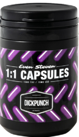
1:1 CAPSULES 15mg THC/15mg CBD Contains: MCT oil, CBD isolate, THC Distillate.