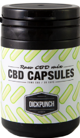
CBD CAPSULES 25mg CBD Contains: MCT oil, CBD isolate.

Capsules are designed with exact THC / CBD doses. Our process includes polishing and quality checks before packing. Every bottle comes with a tamper seal and moisture-absorbing silica pack to ensure freshness.