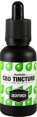
CBD TINCTURE 1000mg CBD Contains: MCT oil, CBD isolate.

Dickpunch tinctures are created using precision manufacturing techniques and the purest distillate resulting in a product that delights and satisfies without the unpleasant aftertastes. Dickpunch tinctures are lab tested and safe to use.